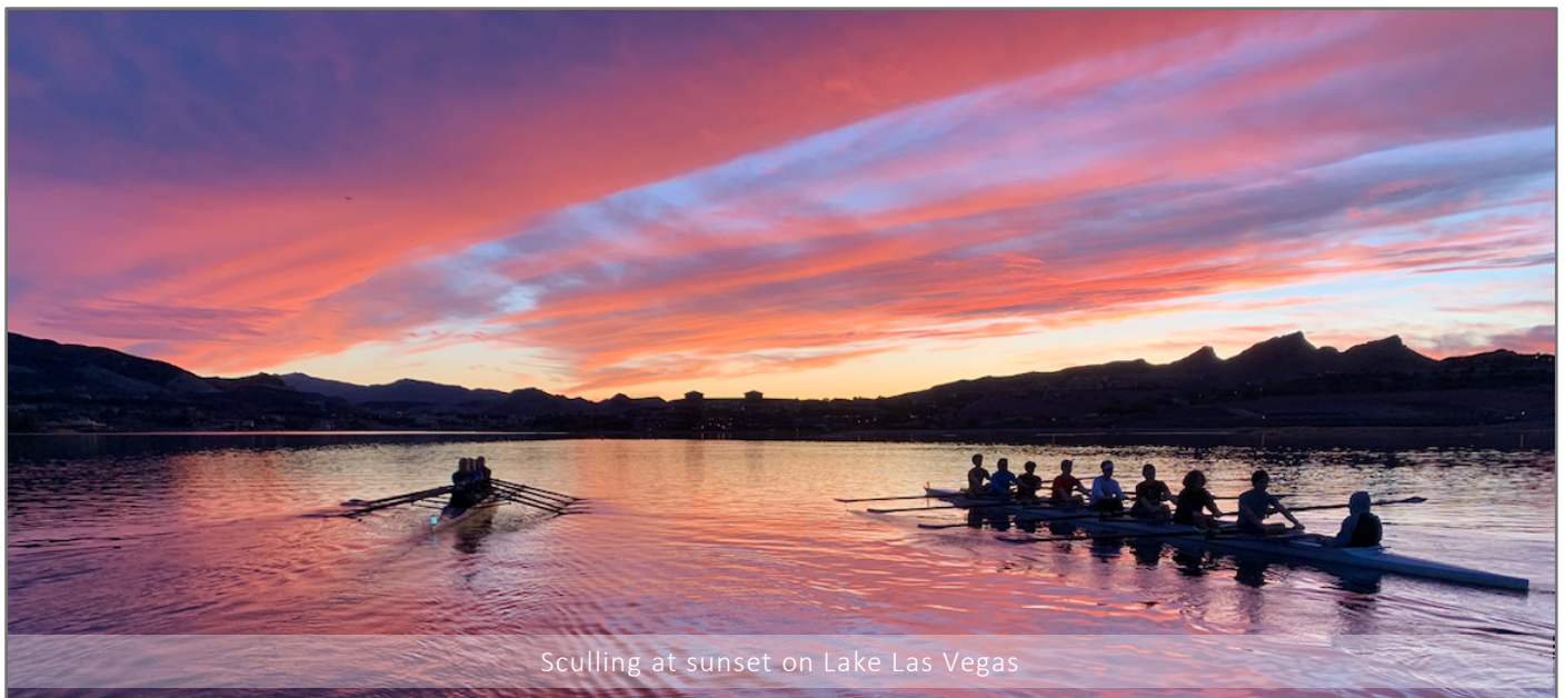
Sculling at sunset on Lake Las Vegas